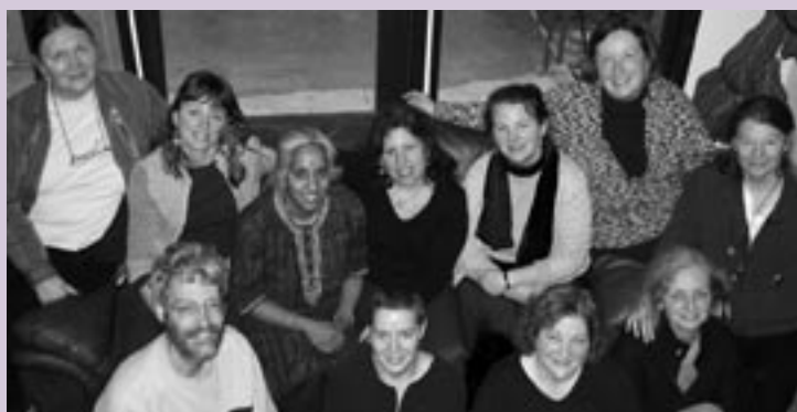
Members of the MANA Division of Research

A lot of time has gone into reviewing the older data collection forms and systems and devising new, better approaches. All at the meeting agreed that the new design will open up a world of possibilities for midwifery research through web-based data collection. For more on MANAstats, visit www.mana.org/statform.html .